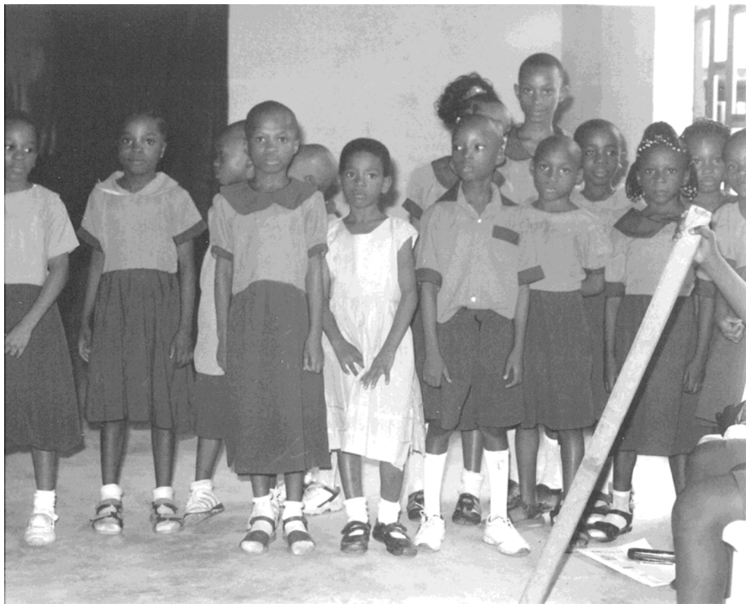
Pupils at the School in Nigeria