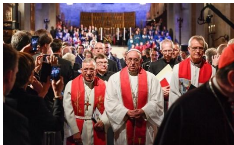
Pope Francis leads a joint commemoration of the Reformation, together with the President and General Secretary of the Lutheran World Federation in Lund cathedral.

This man also said: “We need strong Popes and Bishops with courage, because we must continue toward the path to unity. There is not enough theological dialogue. We must bear witness together.” 8 Now why would a Lutheran Pastor be longing for “strong Popes”? And where in the Bible does it say that everyone must continue on the path to this false “unity”? Certainly, neither the Lord Jesus Christ, nor His Apostles, ever taught such a thing! As for “bearing witness together”, light cannot bear witness with darkness, nor does light bear witness to darkness. It is impossible. Therefore, if Lutherans are able to bear witness together with Papists, there is only one conclusion we can draw: they are both in spiritual darkness – for there is no Gospel light in Rome and, therefore, any other institution in fellowship with Rome has no Gospel light in it either.