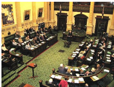
South Australian Parliament