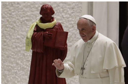
Pope Francis passes by a statue portraying Martin Luther as he arrives for an audience with Lutheran pilgrims at the Vatican.

Romish Cardinal, Kurt Koch, President of the "Pontifical Council for the Unity of Christians" said, "This is not just the commemoration of the 500 th anniversary of the Reformation, but