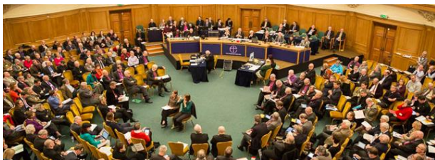
The General Synod

The advice is likely to be endorsed next month by the Church's