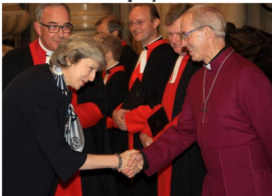
Theresa May and Justin Welby

There are two kinds of Christianity in this country: two contradictory religions both claiming to be real Christianity.